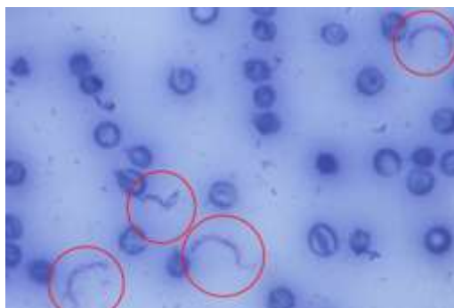
Figure 2. Trypanosoma lewisi in Rats in Banjarnegara District